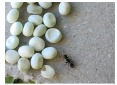
The wasps will move off and can live for over a month

Anastatus will disperse from the cards in search of fruitspotting bugs and then their eggs