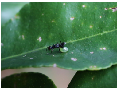
Anastatus search through foliage looking for bug eggs

Anastatus will disperse from the cards in search of fruitspotting bugs and then their eggs