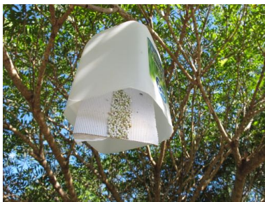
In wet areas, cards can be hung in plastic containers

Place the Anastatus release cards along boundaries where you suspect bugs are entering your crop.