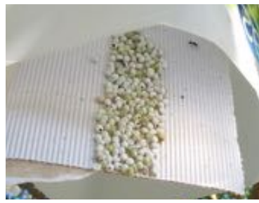
Note the wasp escape holes